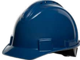
Dark Blue NSB11071E