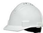
Honeywell North Short Brim Hard Hat Vented SKU: NSB11001E

and engineering knowledge and expertise, as well as many years of experience as leading manufacturers of personal protective equipment (PPE). Honeywell North Short Brim Hard Hat is the new generation of fully certified hard hats providing excellent protection, quality, comfort and a long lifespan, everything for an affordable price. Compatible with Honeywell headgear accessories – face shields, welding and hearing protection – and certified to ANSI, CE/EN, CSA and NOM standards, Honeywell North Short Brim Hard Hat delivers the quality protection you need for the price you expect.