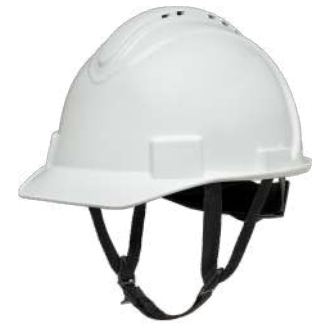
Chin Strap NSB100CS