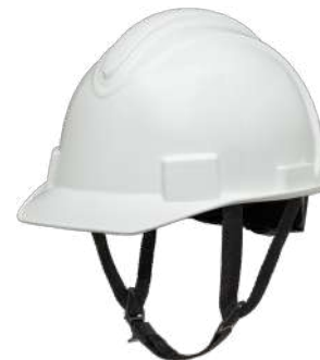
Chin Strap NSB100CS