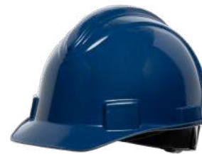
Dark Blue NSB10071E