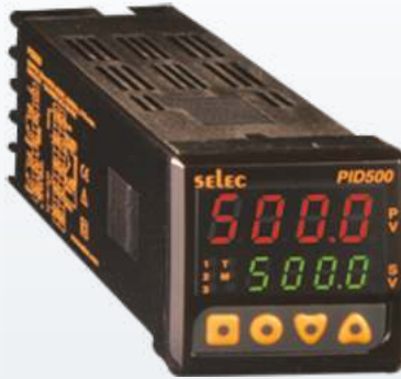
48 x 48mm