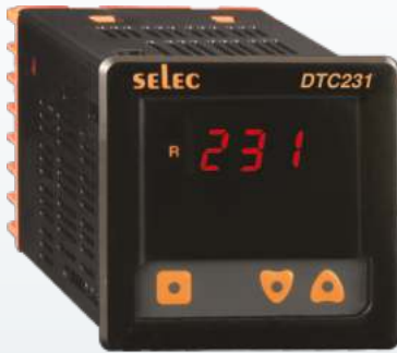
72 X 72mm