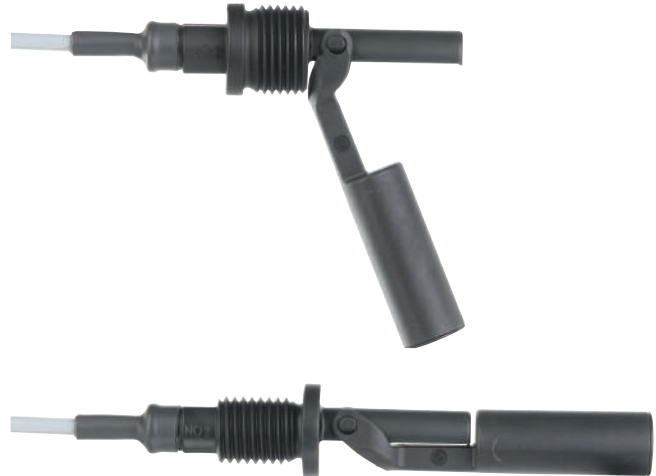
Fig. top: Model RLS-8000 with G ½, installation from outside

To ensure that the model RLS-8000 float switch is perfectly matched to the application on site, WIKA offers design-in solutions. Whether customer-specific tank connection, individualised electrical connections or designs: We adapt the model RLS-8000 for original equipment manufacturers to their respective requirements. This minimises the effort and cost of installation and maintenance, with maximum safety and compatibility.