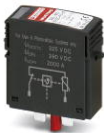
Replacement plug for PV arrester combinations from the VAL-MS 600DC-PV-... product range

Please be informed that the data shown in this PDF Document is generated from our Online Catalog. Please find the complete data in the user's documentation. Our General Terms of Use for Downloads are valid ( http://phoenixcontact.com/download )