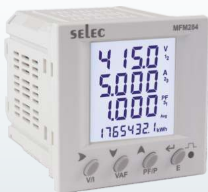
72 x 72mm