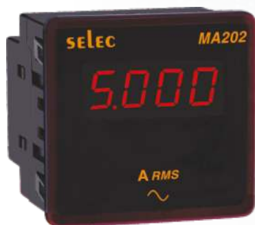
72 x 72mm