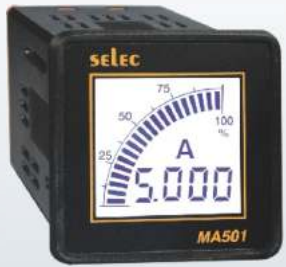
48mm x 48mm