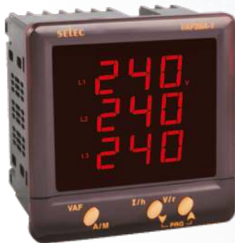
96 x 96 mm