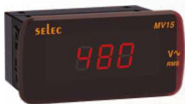
48 x 96 mm