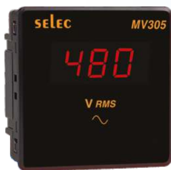
96 x 96 mm