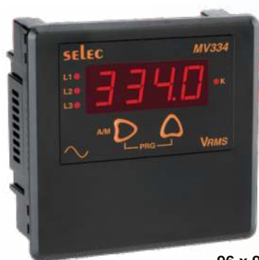
96 x 96 mm