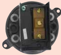
Series 1910 switch with conduit enclosure off. Shows electric switch and set point adjustment screw located on same side for easy installation.