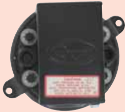
Series 1910 pressure switch with new black cationic epoxy coat plated housing.