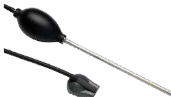
CO-205 Aspirator Kit for flue gas sampling using Fluke family of gas measuring devices.

Visit www.fluke.com to get complete details on these products or ask your local Fluke sales representative.